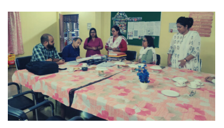
Visit by CARA Team at CCW (Shishugreh), SAA in Kamrup Metro, Assam on March 1st, 2023