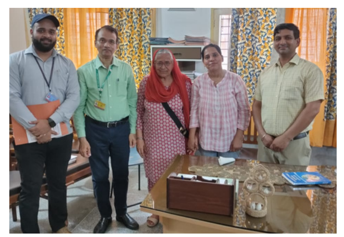
Visited Amritsar, Punjab on 23rd & 24th June, 2023 and reviewed the functioning/performance of various stakeholders involved in adoption process.