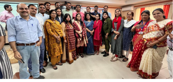
State Orientation Programme on New Adoption Regulations conducted by CARA Team in Madhya Pradesh on March 16 & 17, 2023.